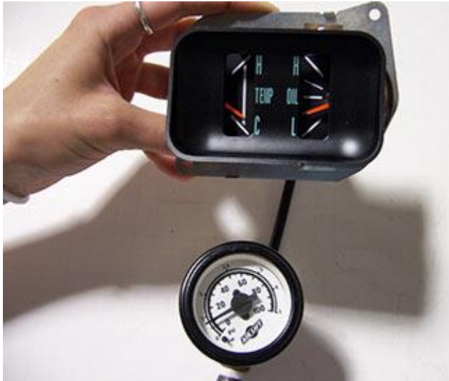
Normal Gauge 10 pounds