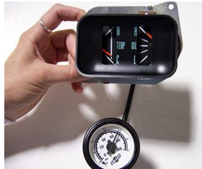
Normal gauge 70 pounds