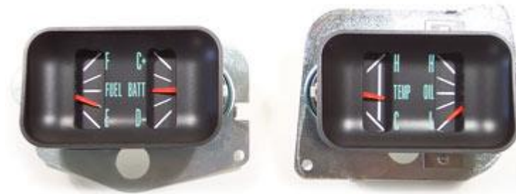
Super Sport Gauges Conversion 1966-67 Chevelle & Nova

SHIFTWORKS® conversion gauges are designed to fit the EXISTING openings in the back of the dash. They are simple to install and instructions are included.