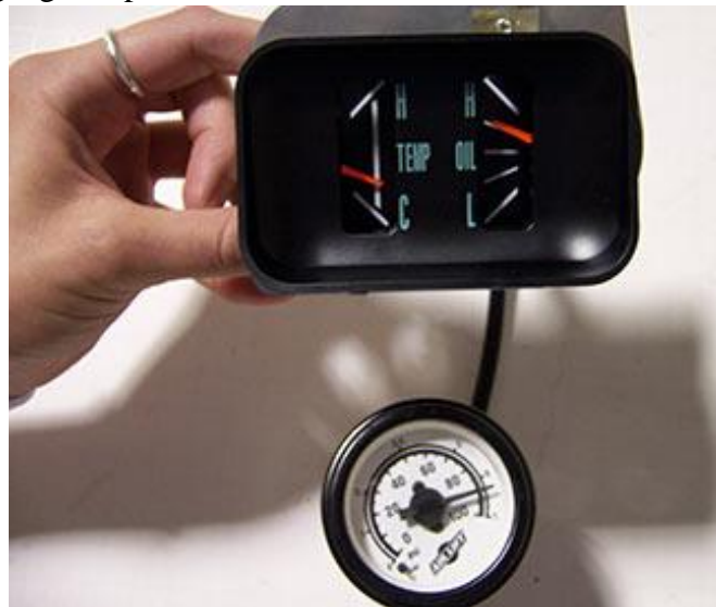
HOP gauge at 90 pounds