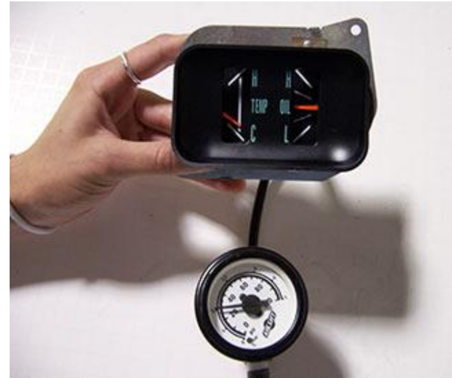
Normal gauge 30 pounds