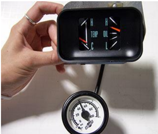
Normal gauge 50 pounds