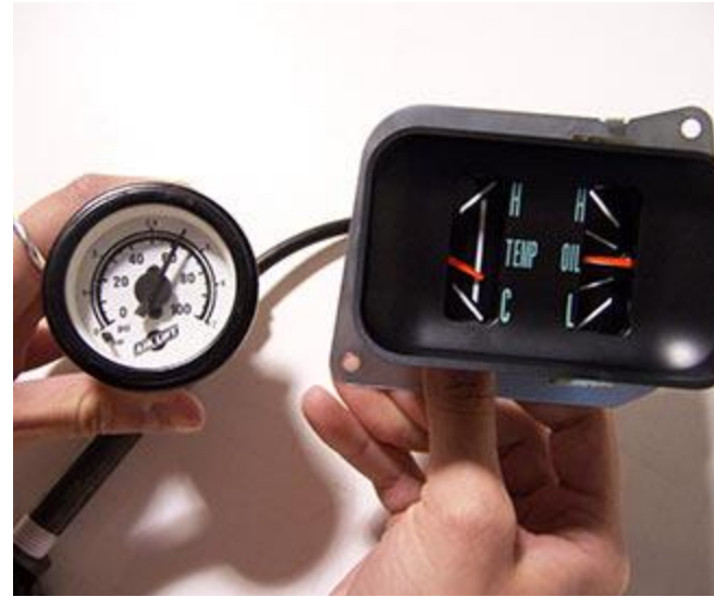
HOP gauge 60 pounds