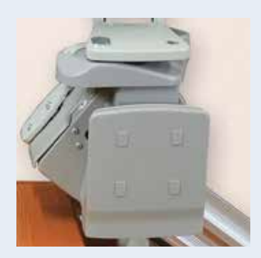
Power folding footrest automatically flips up/down when seat is raised/lowered. Arm switch control optional.