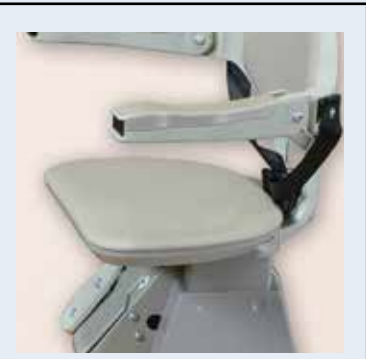
Power swivel seat for effortless exit. Armrest switch control or wireless call/send.