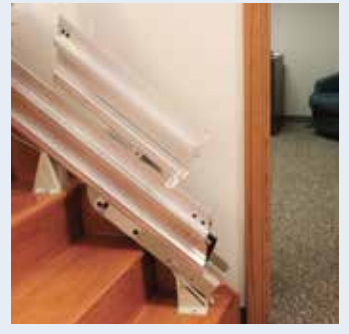
Power or manual folding rail for narrow hallway or when doorway is at the bottom of stairs. Manual operation or push button automatic.