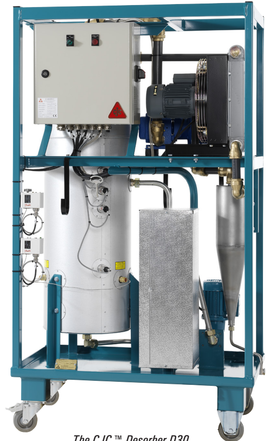
The CJC™ Desorber D30