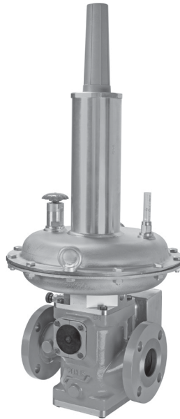
Figure 1. LS200 Series Direct-Operated Regulators