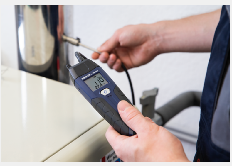
The Wohler DM 602 is a fast and precise tool to adjust burners and measure chimney drafts.