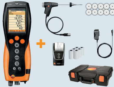
Kit with Printer and Paper shown above

includes testo 330-1 LX with O 2 and CO sensors; Li-Ion battery; AC power adapter; 12" flue gas probe, 1/4" dia., w 7 ft. hose; particle filters (10); certificate of conformity; and case