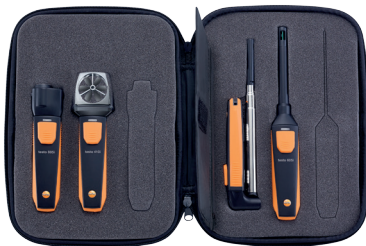
VAC Smart Probe Kit: 0563 0003