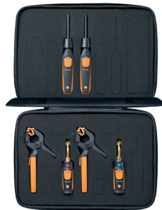
AC/R Test & Load Kit: 0563 0009