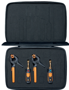
AC & Refrigeration Kit: 0563 0002 20