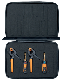
AC & Refrigeration Kit: 0563 0002 20