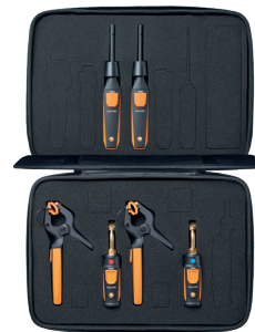
AC/R Test & Load Kit: 0563 0009