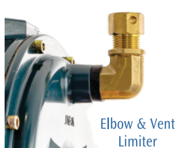
Elbow & Vent Limiter