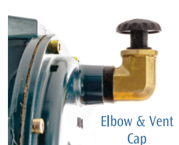
Elbow & Vent Cap