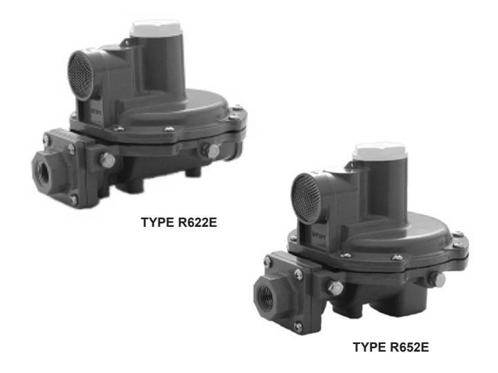
Figure 1. Type R622E and R652E 2-PSI Service Regulators