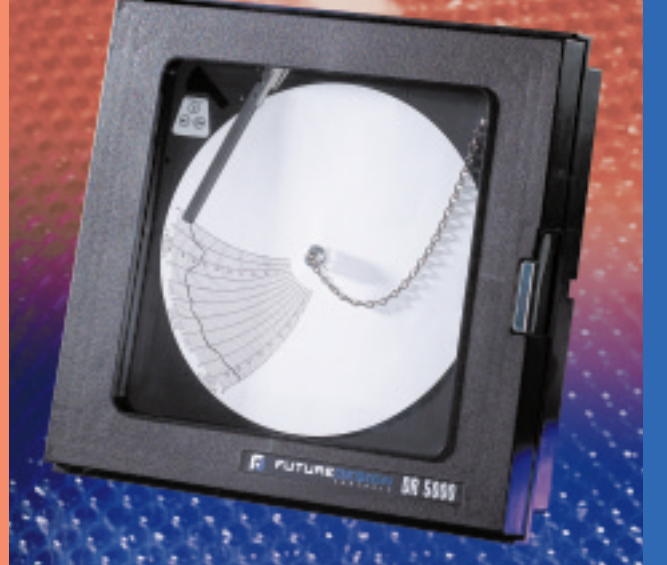
DR 5000 CIRCLE CHART RECORDER

The thermal print version offers a single chart inventory for all of your recording needs. "Print your own" chart technology includes real time trend and digital data directly on your historical records. No more confusion when replacing charts. The DR 5000 – the right choice for recording.