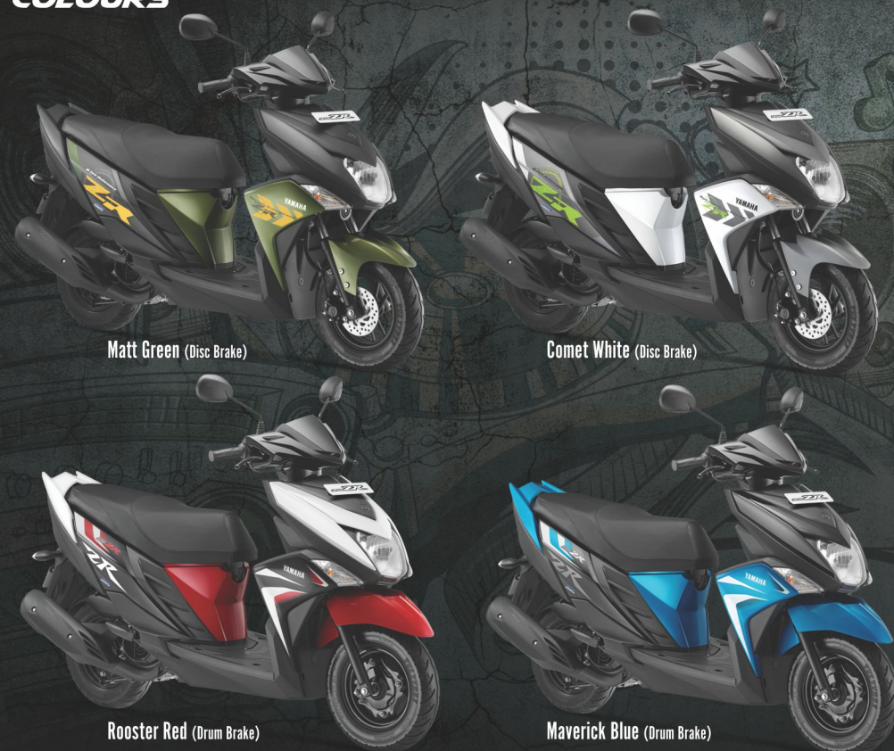
Matt Green (Disc Brake)