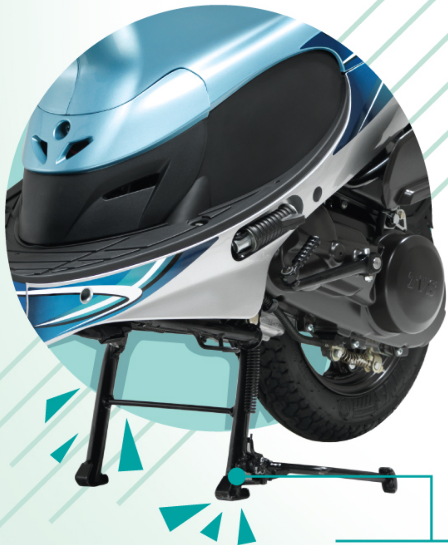
EaZy* CENTER STAND (*Patented technology)