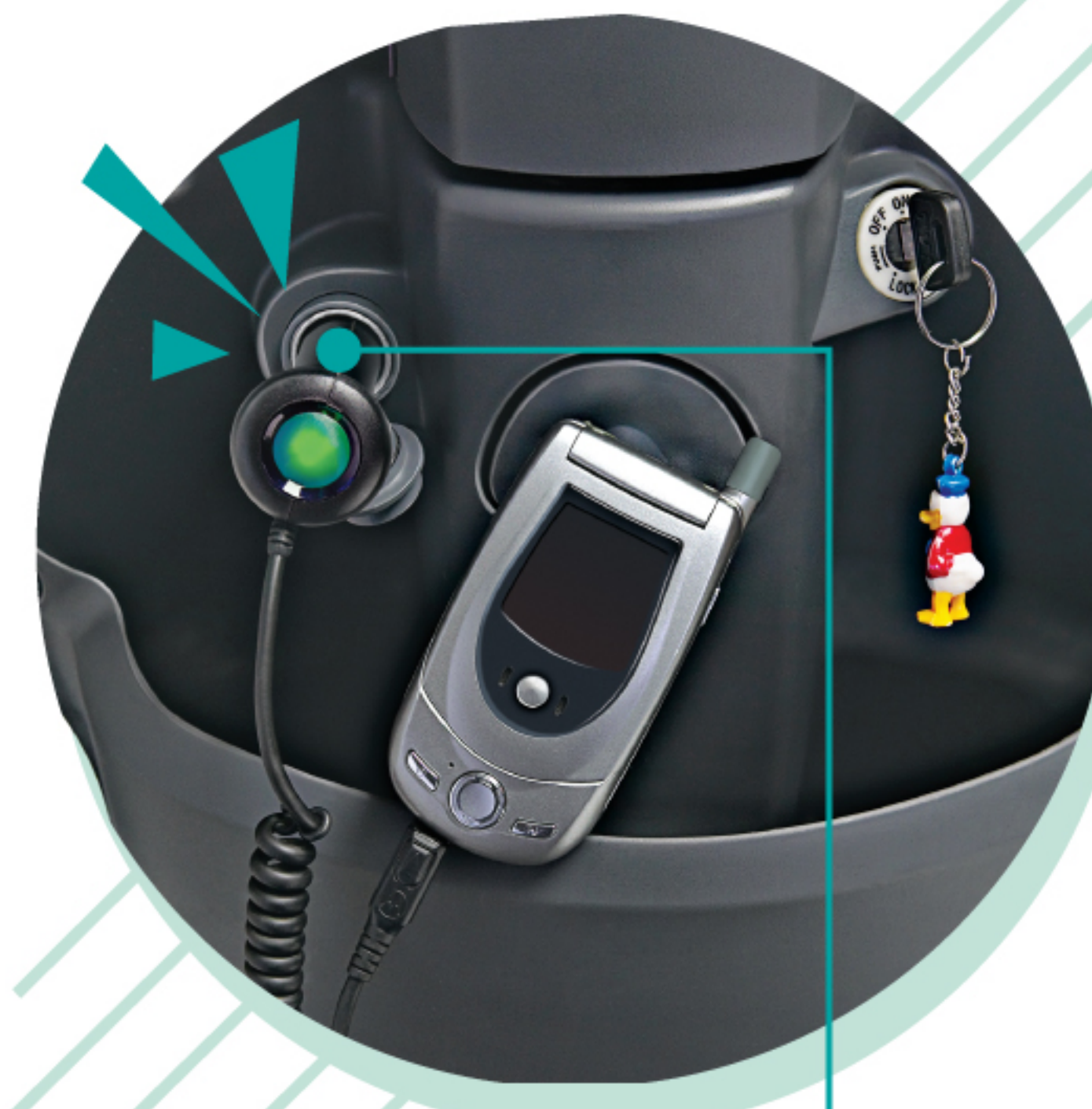
MOBILE CHARGER SOCKET