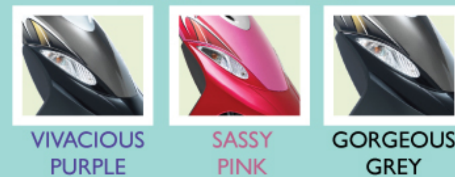
VIVACIOUS PURPLE SASSY PINK GORGEOUS GREY