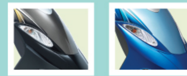
FROSTED BLACK DAZZLING BLUE