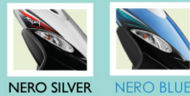
NERO SILVER NERO BLUE