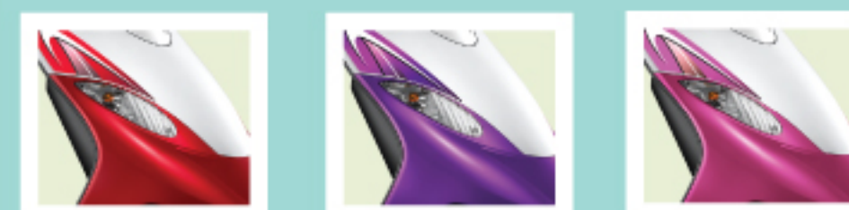
BLUSH RED PASSION PURPLE PERKY PINK