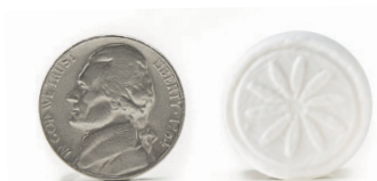
small size for multi use!