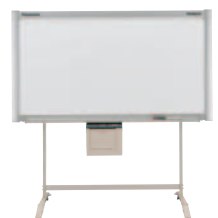
UB-5825 2-Screen Wide size