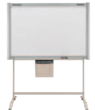
UB-5325 2-Screen Standard size