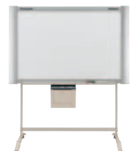
UB-7325 4-Screen Standard size (Stand option)