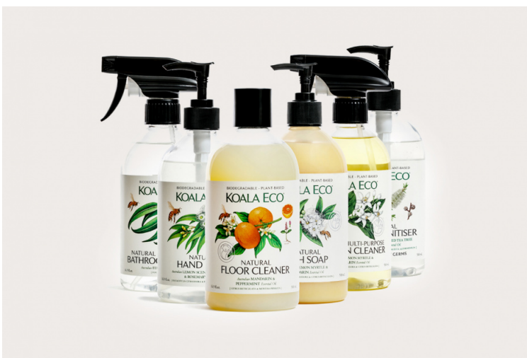
Best Seller Collection | 6 Pack