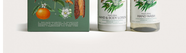
Gift Collection - 2 Pack | Lemon Scented Eucalyptus & Rosemary