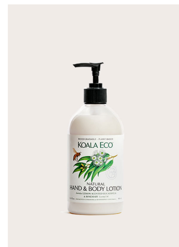
Natural Hand and Body Lotion | Lemon Scented Eucalyptus & Rosemary