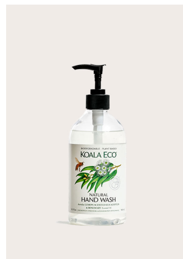
Natural Hand Wash | Lemon Scented Eucalyptus & Rosemary