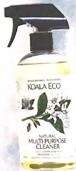
Natural Multi-Purpose Cleaner by Koala Eco