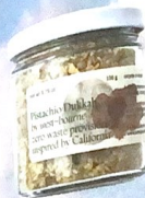
Pistachio Dukkah by Westbourne

6 WOMEN-OWNED BRANDS WHOSE PRODUCTS WE COVET.