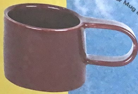
Tubular Mug by Ekua Ceramics