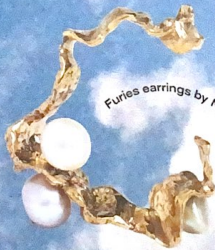
Furies earrings by Nature

6 WOMEN-OWNED BRANDS WHOSE PRODUCTS WE COVET.