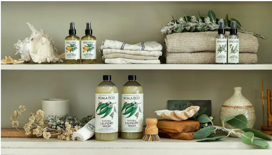
Are you filling your home with the good stuff?