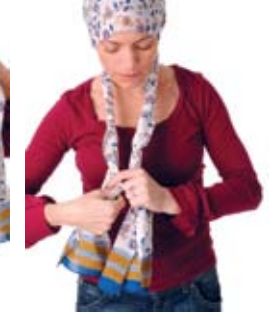
3. Bring the ends of the scarf to front & twist the ends tightly from nape to scarf border.