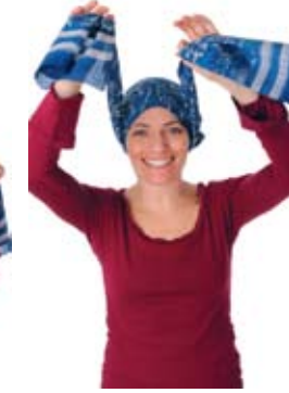
1. Place center of a 15' x 72" scarf across the top of the head & draw the ends back.