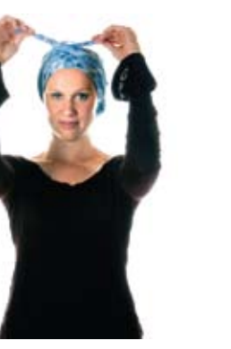
and bring around to and tuck in at sides.