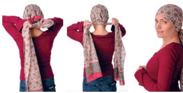
4. Tie a knot at the nape of the neck.