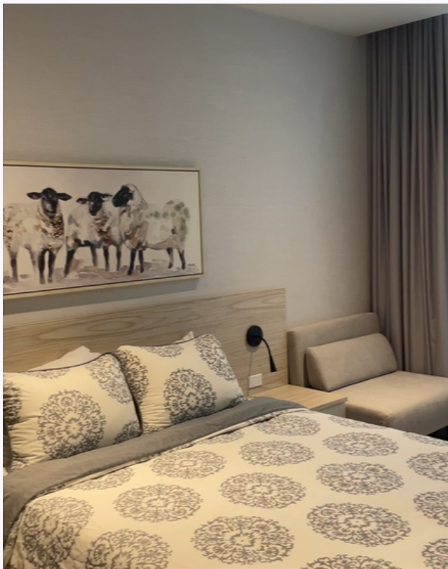
Pavillon Kat Demes offers six thoughtfully furnished private bedrooms and washrooms, providing a cozy and serene environment where parents can rest and recharge. Photo provided by Polysleep.

Generously spearheaded by donors, the pavilion stands as a beacon of support, being the sole facility in Quebec to offer complimentary, temporary housing for parents during their child's medical treatment. With a focus on fostering a nurturing environment, the Pavillon Kat Demes will feature six private bedrooms, each equipped with a queen-sized bed and workspace, along with private washrooms for added comfort. The facility will also include a communal living room, complete with a television, laundry facilities, and an outdoor terrace. Complimentary breakfast services will further alleviate the daily routine for resident families.