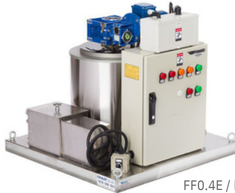
FF0.4E / FF0.6E