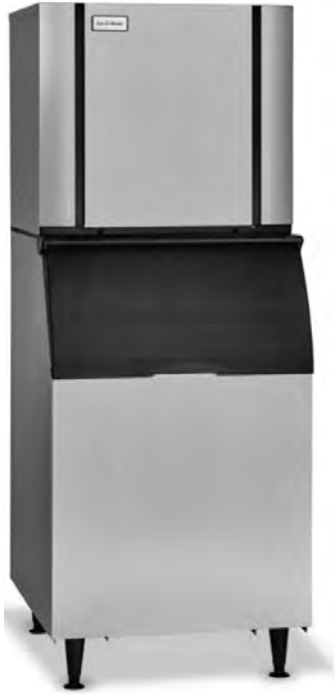
CIM1135 ON ICB230SC