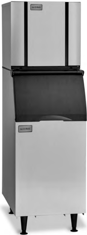
CIM0825 ON B42