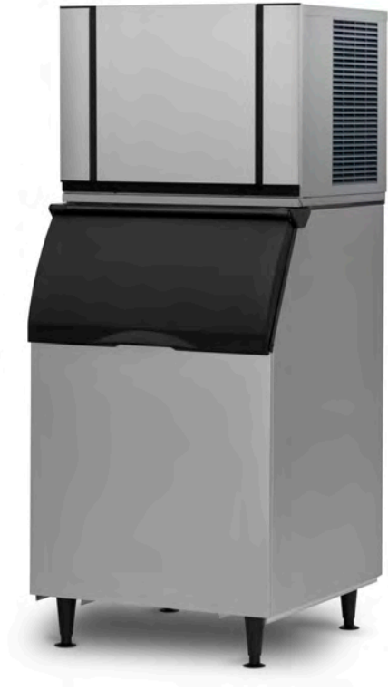
CIMO635 ON ICB230SC