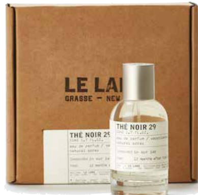
LE LABO'S Thé noir fragrance, $175, www.lelabofragrances.com .