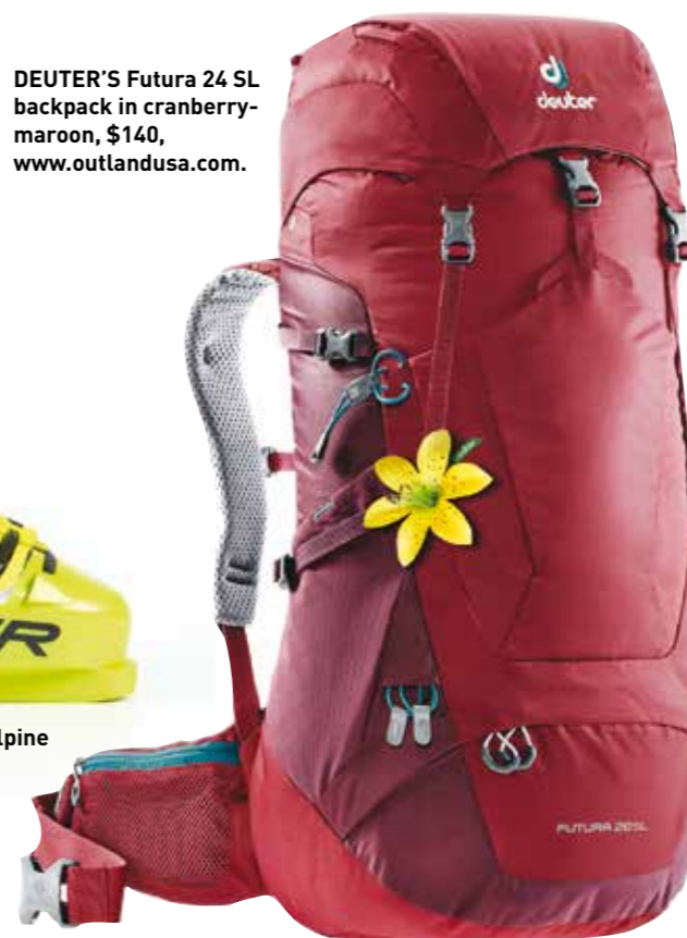
DEUTER'S Futura 24 SL backpack in cranberry-maroon, $140, www.outlandusa.com .