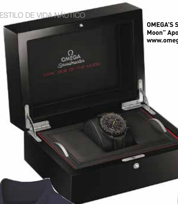
OMEGA'S SPEEDMASTER "Dark Side of the Moon" Apollo 8 watch, $9,750, www.omegawatches.com .

If you're feeling sheepish about extreme sports, opting for cozy lunches by the fire in nearby Courchevel; it would be wise to slip on a pair of Giuseppe Zanotti's satin and suede boots, which take their inspiration from basketball sneakers and the finest Italian craftsmanship. Trussardi's Max Logo shopping tote achieves a similar harmony between sportive and chic; making it the perfect dash-n-go leisure bag. After the day's many activities, be sure to lather on some of Baked at Home's potent CBD Extra Strength pain cream, designed to penetrate into the skin to any sores, aches and pains from your busy, albeit refined, daily jaunts.