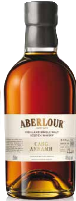
ABERLOUR Casg Annamh, $59, www.aberlour.com