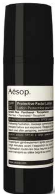
AESOP'S Protective Facial Lotion with SPF 30, $77, www.aesop.com .