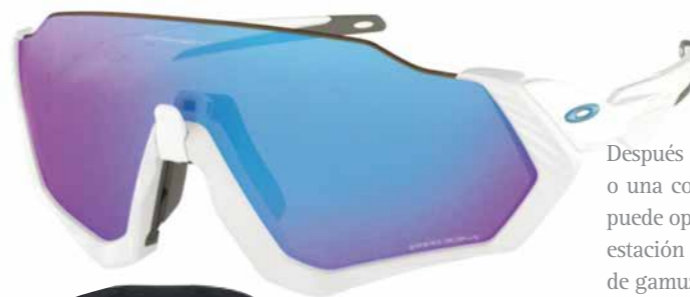
Luxottica for OAKLEY sunglasses, $241, www.oakley.com .

Después de todo un día en las pistas, cúbrase de cashmere para salir a cenar o una copa de cognac en el chalet. Si no le interesan los deportes extremos puede optar por agradables almuerzos al calor de una chimenea en la cercana estación de Courchevel. Le recomiendo ir bien calzado con un par de botas de gamuza y satén de Giuseppe Zanotti, que están inspiradas en las zapatillas de baloncesto y la más alta artesanía italiana. La bolsa de compras Max Logo de Trussardi es un buen ejemplo de armonía entre lo deportivo y lo chic, el complemento ideal para cualquier momento. Después de un día de mucha actividad no se olvide de la potente crema para el dolor CBD Extra Strength de Baked At Home.