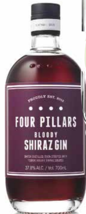
FOUR PILLARS Bloody Shiraz Gin, $45, www.fourpillarsgin.com.au .