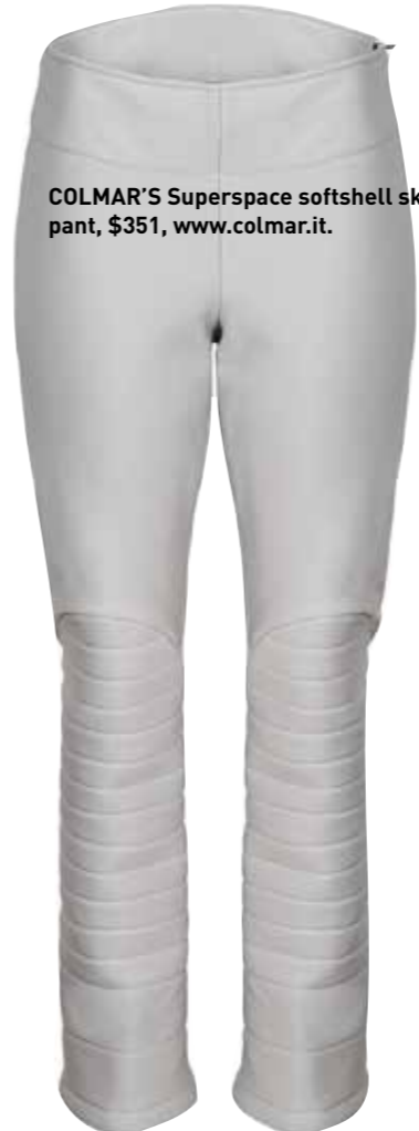
COLMAR'S Superspace softshell ski pant, $351, www.colmar.it .