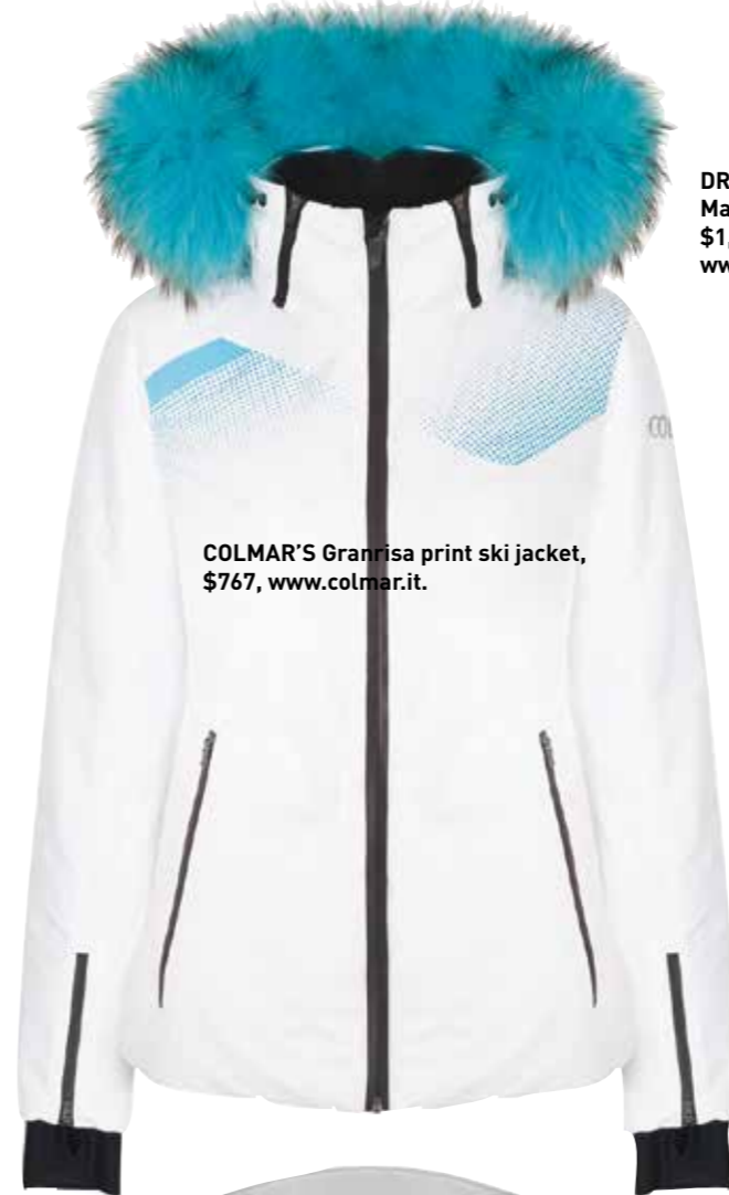
COLMAR'S Granrisa print ski jacket, $767, www.colmar.it .