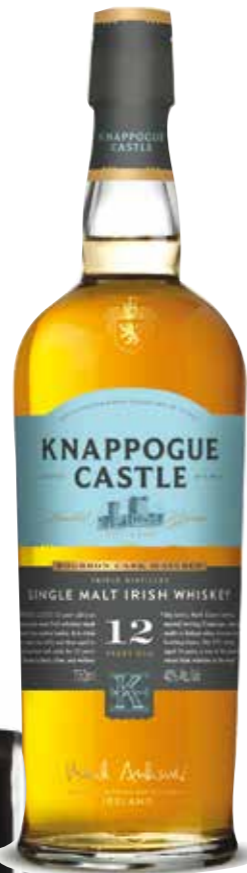
KNAPPOGUE CASTLE 12 Year Old Single Malt Whiskey, $50, www.knappoguewhiskey.com .