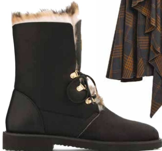
GIUSEPPE ZANOTTI'S Phillis boot with shearling fur, $1,150, www.giuseppezanotti.com .