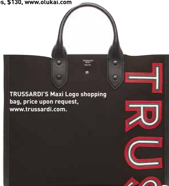
TRUSSARDI'S Maxi Logo shopping bag, price upon request, www.trussardi.com .