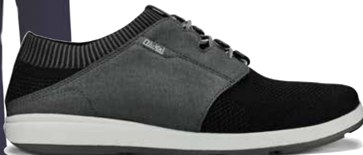
MAKIA ULANA KAI, Hawaiian-inspired men's shoes, $130, www.olukai.com