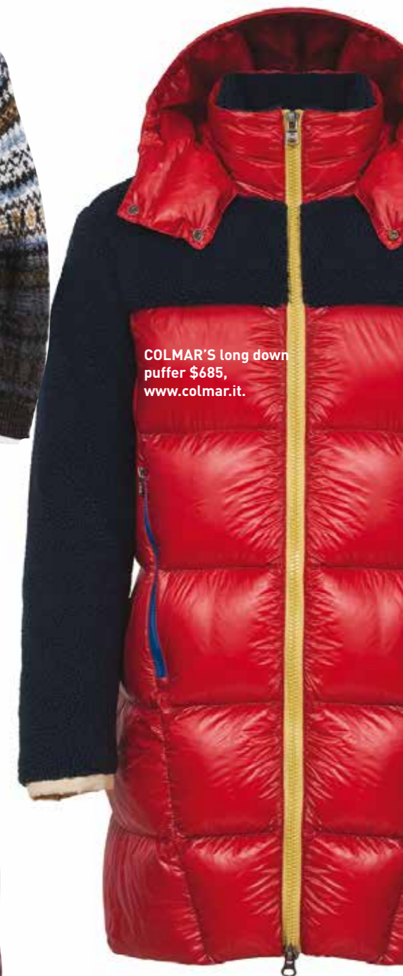
COLMAR'S long down puffer $685, www.colmar.it .