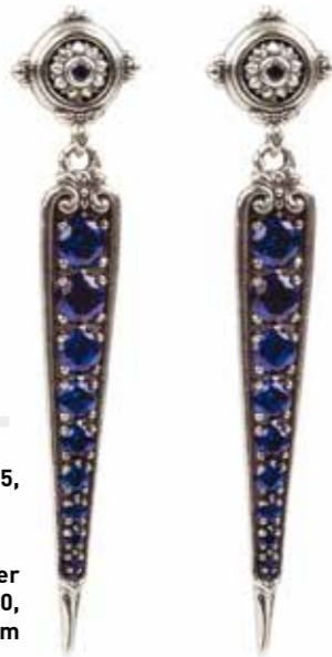
KONSTANTINO'S sterling silver earrings with Blue Spinel, $450, www.kostantino.com