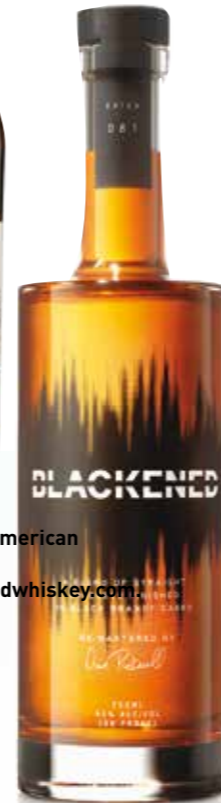
BLACKENED American Whiskey, $50, www.blackenedwhiskey.com .