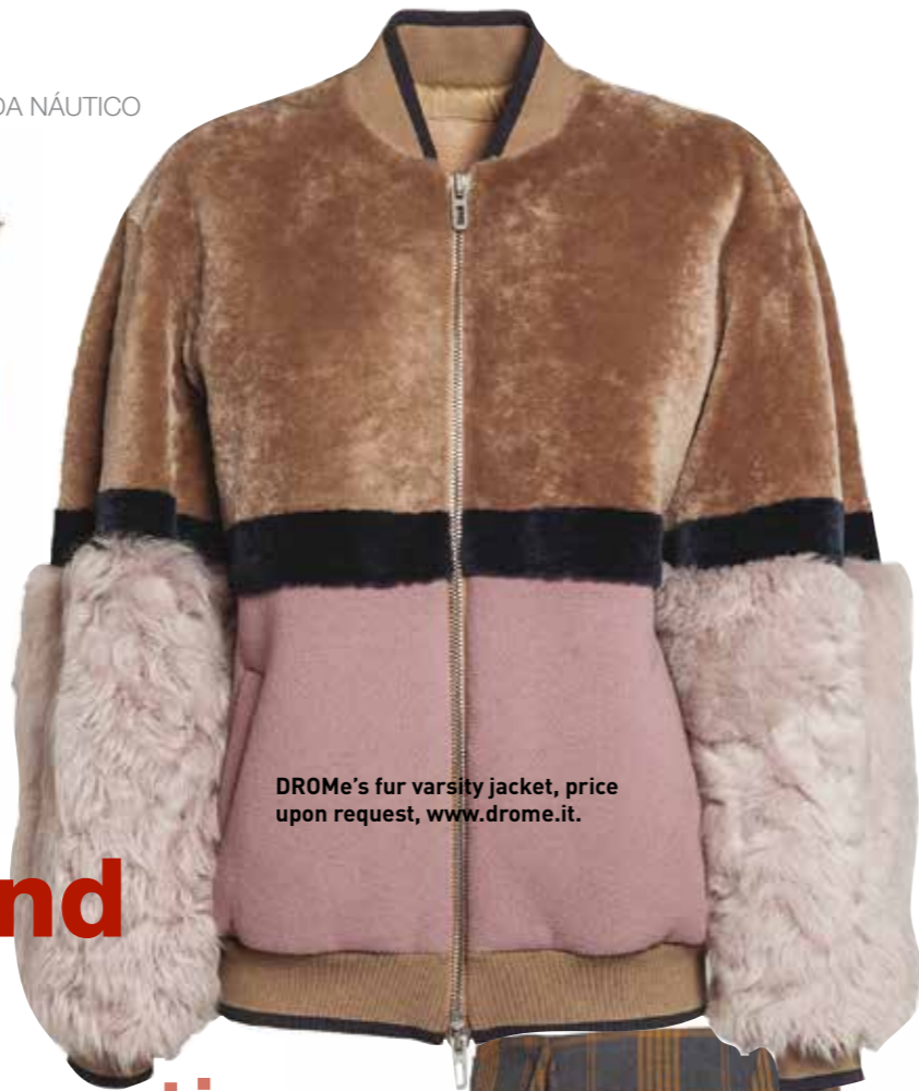
DROME's fur varsity jacket, price upon request, www.drome.it .