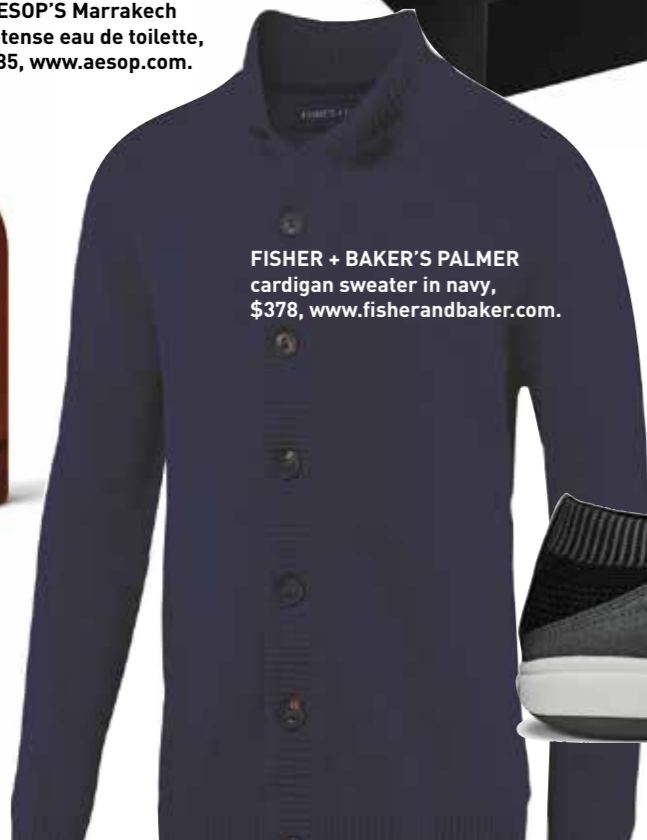
FISHER + BAKER'S PALMER cardigan sweater in navy, $378, www.fisherandbaker.com .