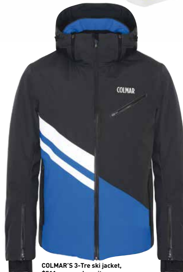
COLMAR'S 3-Tre ski jacket, $511, www.colmar.it .