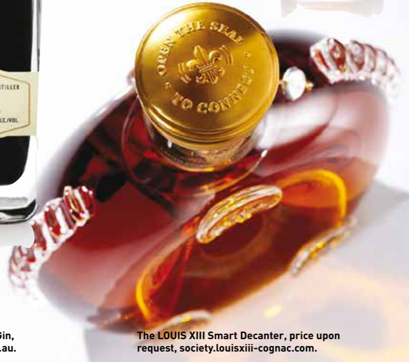
The LOUIS XIII Smart Decanter, price upon request, society.louisxiii-cognac.com .