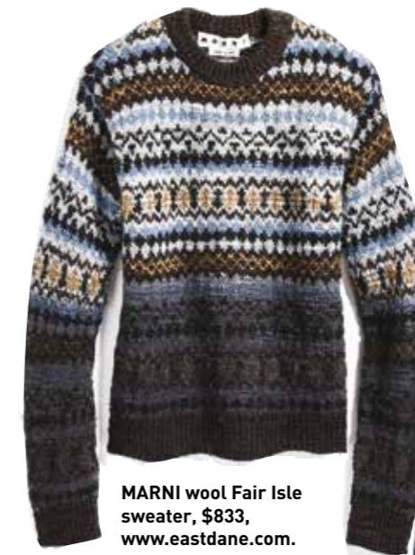
MARNI wool Fair Isle sweater, $833, www.eastdane.com .