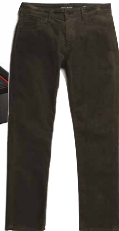
MAVI pant, $128, www.mavi.com .