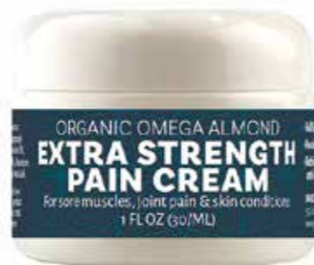
JENNY'S BAKED at Home extra strength CBD pain cream, $89, www.bakedathomecompany.com .