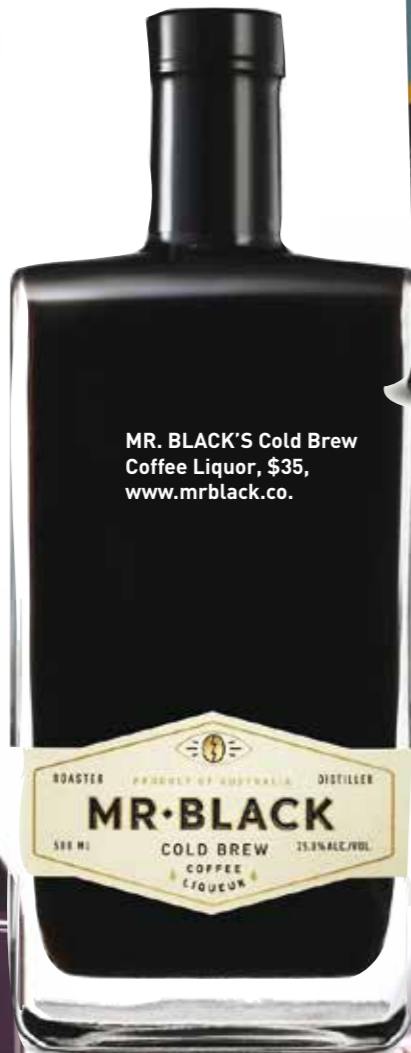
MR. BLACK'S Cold Brew Coffee Liqueur, $35, www.mrblack.co .