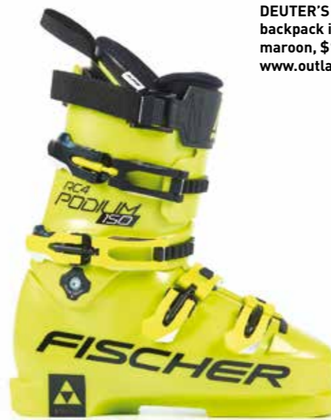
FISCHER'S RC4 podium men's alpine ski boots, price upon request, www.fischersports.com .