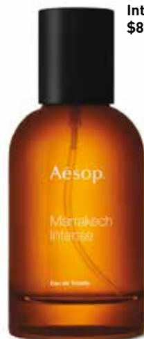
AESOP'S Marrakech Intense eau de toilette, $85, www.aesop.com .

Después de todo un día en las pistas, cúbrase de cashmere para salir a cenar o una copa de cognac en el chalet. Si no le interesan los deportes extremos puede optar por agradables almuerzos al calor de una chimenea en la cercana estación de Courchevel. Le recomiendo ir bien calzado con un par de botas de gamuza y satén de Giuseppe Zanotti, que están inspiradas en las zapatillas de baloncesto y la más alta artesanía italiana. La bolsa de compras Max Logo de Trussardi es un buen ejemplo de armonía entre lo deportivo y lo chic, el complemento ideal para cualquier momento. Después de un día de mucha actividad no se olvide de la potente crema para el dolor CBD Extra Strength de Baked At Home.