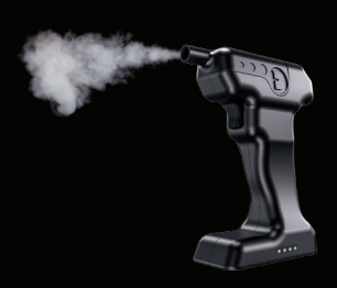
4. PRESS TRIGGER TWICE To produce Aroma again