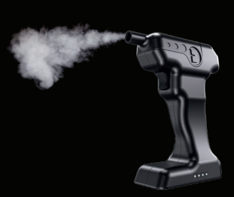
5. REPLACE TANK Every 8 weeks Or once Aroma Cloud smells burnt