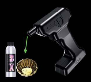
5. DIP NOZZLE TIP Into Bubble X Jigger