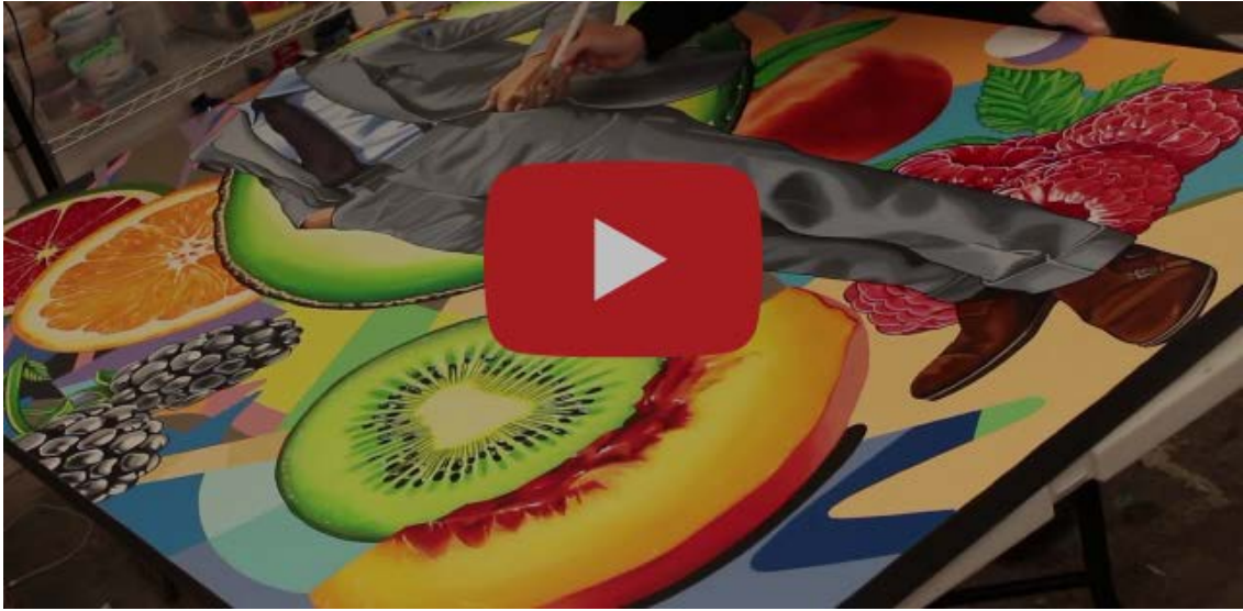
Goodbye 2021, Hello 2022 (Team Appreciation)