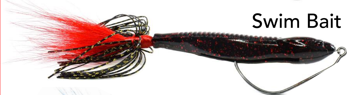
Swim Bait Rig