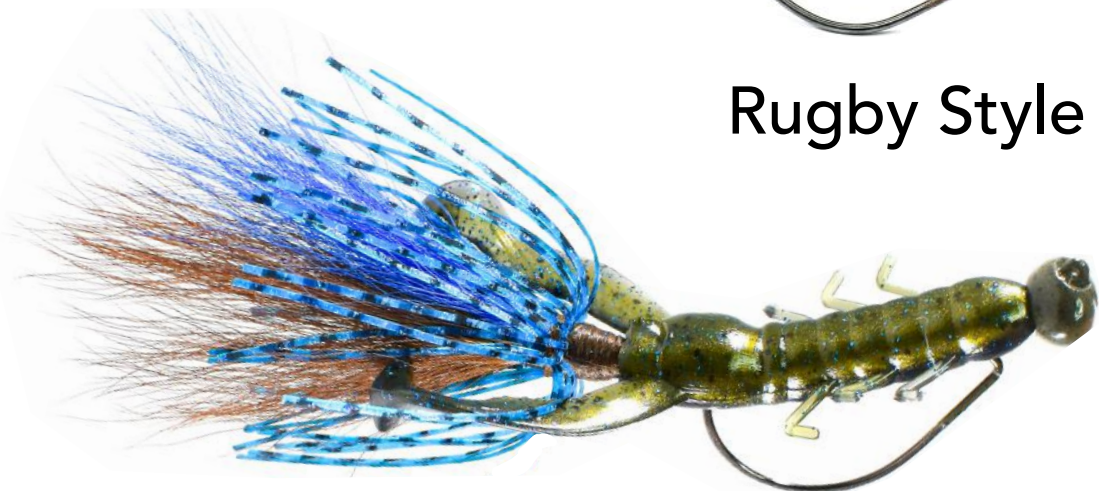
Rugby Style Rig