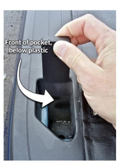
Fig. 1 Fig. 2