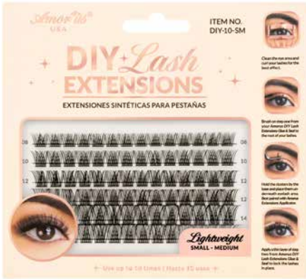
DIY-10-SM Small-Medium | 8mm to 14mm