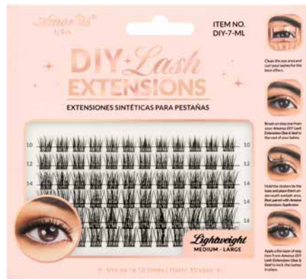
DIY-7-ML Medium-Large | 10mm to 16mm