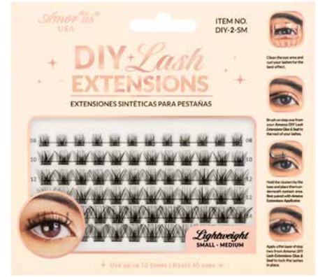
DIY-2-SM Small-Medium | 8mm to 14mm