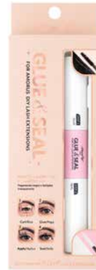
Lash Extension Applicator