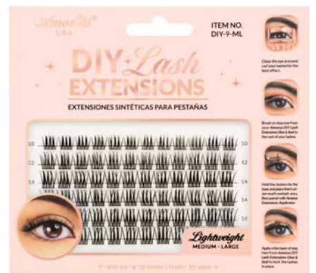
DIY-9-ML Medium-Large | 10mm to 16mm