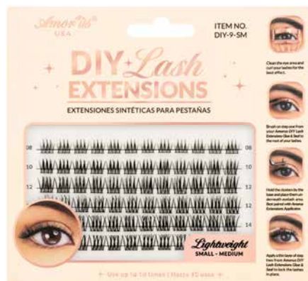
DIY-9-SM Small-Medium | 8mm to 14mm