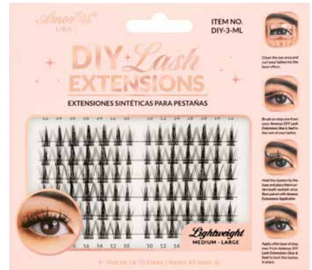
DIY-3-ML Medium-Large | 10mm to 16mm