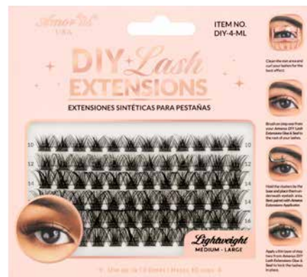
DIY-4-ML Medium-Large | 10mm to 16mm