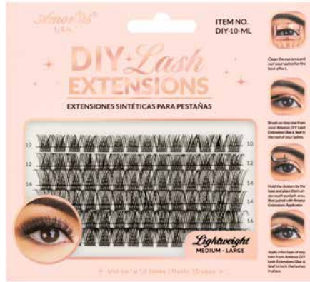
DIY-10-ML Medium-Large | 10mm to 16mm