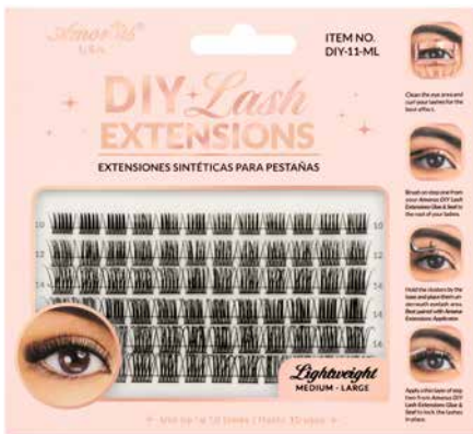
DIY-11-ML Medium-Large | 10mm to 16mm