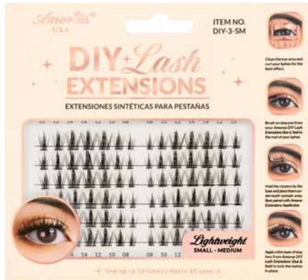
DIY-3-SM Small-Medium | 8mm to 14mm