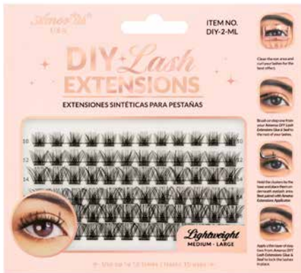
DIY-2-ML Medium-Large | 10mm to 16mm