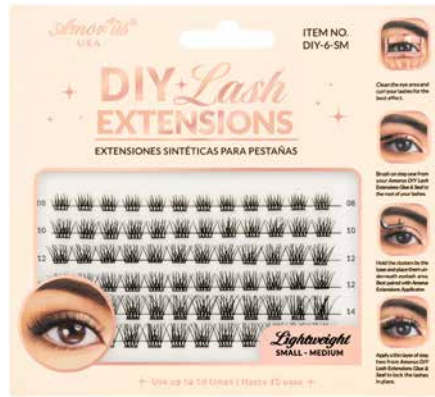
DIY-6-SM Small-Medium | 8mm to 14mm