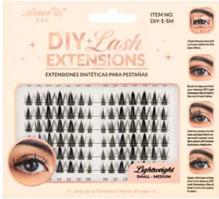
DIY-1-SM Small-Medium | 8mm to 14mm