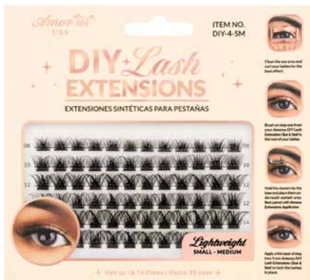
DIY-4-SM Small-Medium | 8mm to 14mm