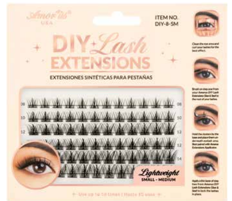
DIY-8-SM Small-Medium | 8mm to 14mm