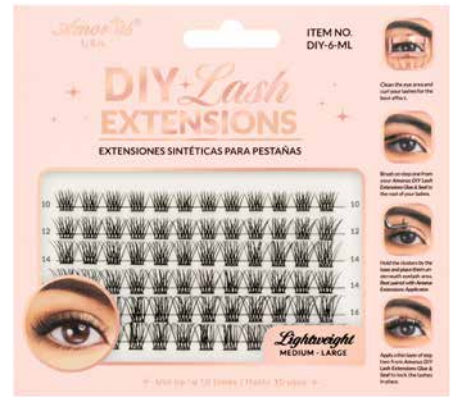
DIY-6-ML Medium-Large | 10mm to 16mm