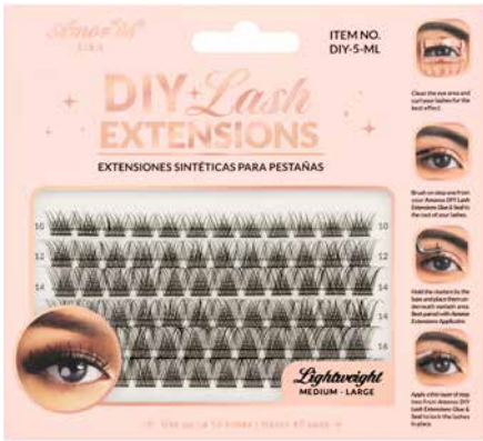
DIY-5-ML Medium-Large | 10mm to 16mm