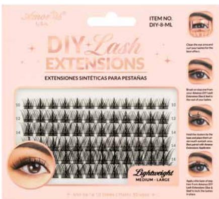
DIY-8-ML Medium-Large | 10mm to 16mm