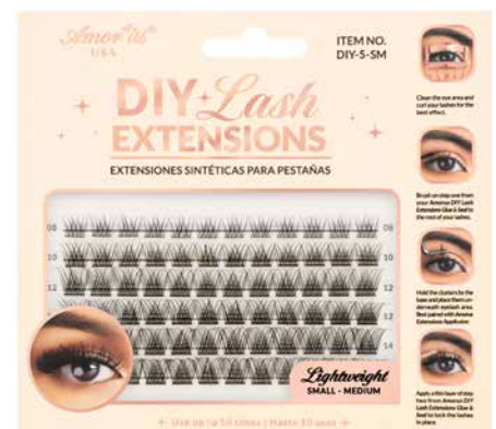
DIY-5-SM Small-Medium | 8mm to 14mm