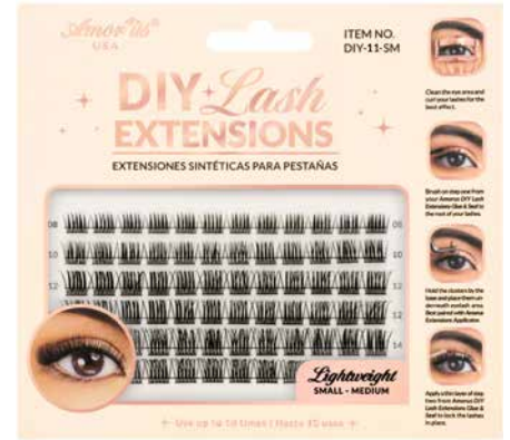
DIY-11-SM Small-Medium | 8mm to 14mm