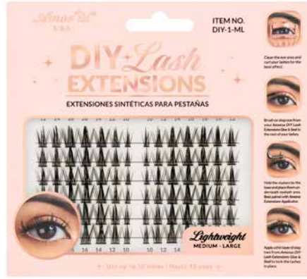
DIY-1-ML Medium-Large | 10mm to 16mm