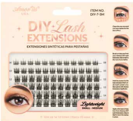
DIY-7-SM Small-Medium | 8mm to 14mm