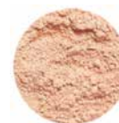
CO-LSP-03 Just Peachy