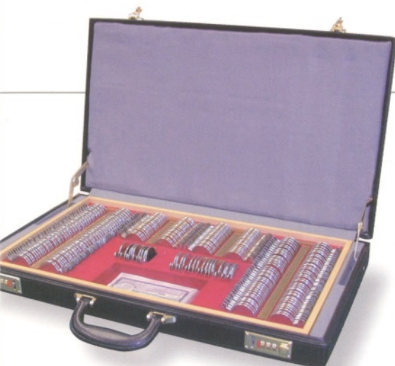
Carrying Case is standard with the Full Diameter Trial Lens Set