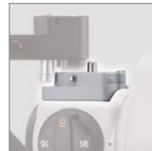
» Tonometer Mount for R900 (SO-TM1)