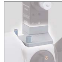
» Tonometer Mount for 870 (SO-TM2)