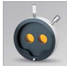
» Yellow Filter