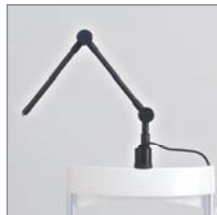
» External Fixation Target (SO-FT02)