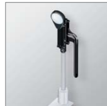
» Hruby Lens (SO-HL01)