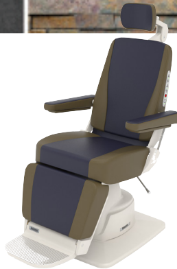
PACIFIC COAST Imperial Blue | Taupe