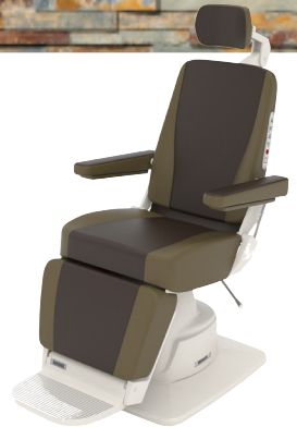
DAKOTA Mocha | Taupe