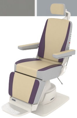
BEACHCOMBER Sand | Plum Smoke | Grey