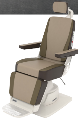
TIMBER GLEN Concrete | Taupe | Mocha