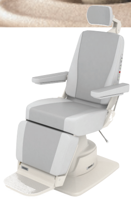
COOL BREEZE Grey | Lite Grey