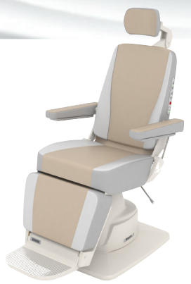
DAYDREAM Oatmeal | Lite Grey | Grey