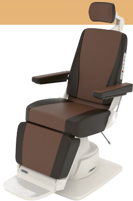
BROWNSTONE Terra Cotta | Otter