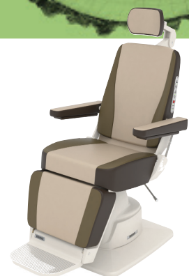
OASIS Bucksuede | Concrete | Sand