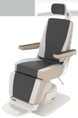
DAY SPA Slate | Lite Grey | Oatmeal