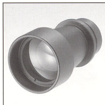
3 X Long eye relief eye piece (option)