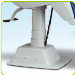
Exclusive telescoping hydraulic cylinder system.

The MARCO E-Z TILT CHAIR combines the most simplified manual reclining motion with a new modern, sophisticated appearance. Utilizing an effortless, silky smooth counterbalancing system, the E-Z Tilt makes reclining any size patient easy and instantaneous; no electronic motors to slow you down! The Marco E-Z Tilt also incorporates the only double hydraulic cylinder system in the industry, creating an extended range of elevation — from extra low to extra high, that accommodates a full range of patient and practitioner sizes. The sealed hydraulic chair base is an attractive, low-profile non-leaking system that automatically “bleeds” unwanted air bubbles from the hydraulic hose. This exclusive design also