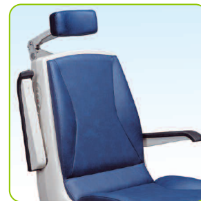
Ergonomically designed arms rotate up for patient flexibility.