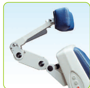
Single-handed headrest with locking indicator.

eliminates many complicated and unnecessary components, resulting in much greater reliability.