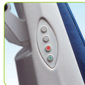
New overlay switch panels on both sides of the chair for convenient fingertip adjustments.

eliminates many complicated and unnecessary components, resulting in much greater reliability.