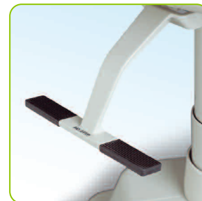
Foot-activated rotation lock can easily be activated from both sides of the chair.