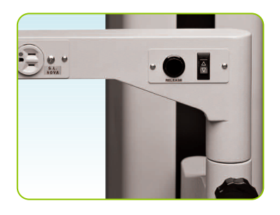
Deluxe 2 Lower Slit Lamp Arm

market. Innovative features such as an electronic slit lamp arm release button, overhead room light switch, and a laborious ten-step hand-finished painting process make the Deluxe 2 Stand a unique and differentiated product. While maintaining our usual high standards of function, quality and