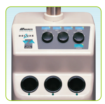
Deluxe 2 Stand fullfeatured instrument control panel, Stock #1206

durability, the new Deluxe 2 Stand also remains competitively priced. For a compelling side-by-side demonstration against any other instrument stand, contact your local authorized Marco distributor.