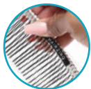
Right Thumb on HairZing Label

Tip: Your thumb should rest on the HairZing label.