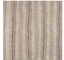
ASH NATURAL Ash Wool, Natural Sisal