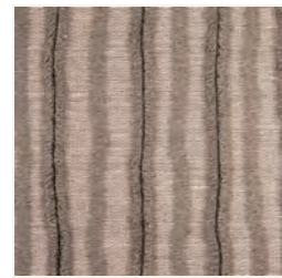
MINK ALMOND CREAM Mink Wool, Almond Cream Sisal