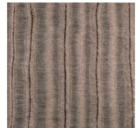
MINK UMBRIA Mink Wool, Umbria Sisal