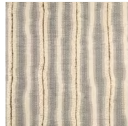
DOVE ELEPHANT Dove Wool, Elephant Sisal