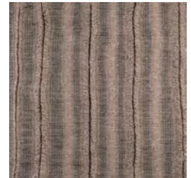
MINK UMBRIA Mink Wool, Umbria Sisal