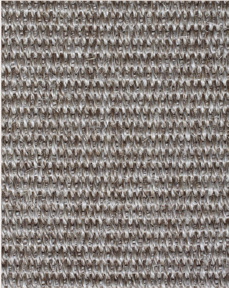
IMAGE ABOVE REPRESENTS A MAGNIFIED VIEW

Avant and Urbana are woven in 100% natural sisal treated with UltraFiber, an innovative stain-resistant, fire-retardant technology deep at the fiber level, making it safe for children and pets. Merida UltraFiber rugs ensure durability and long-lasting protection for high-traffic areas in residential, retail, or hospitality settings.