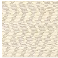
DOVE NATURAL Dove Wool, Natural Sisal