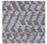
BAY RAISIN Bay Wool, Raisin Sisal