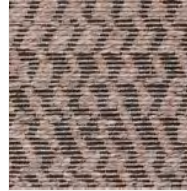
MINK UMBRIA Mink Wool, Raisin Sisal