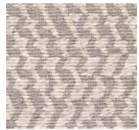
ASH ELEPHANT Ash Wool, Elephant Sisal