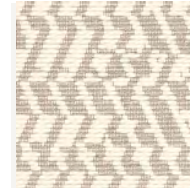
DOVE ICE FOG Dove Wool, Ice Fog Sisal