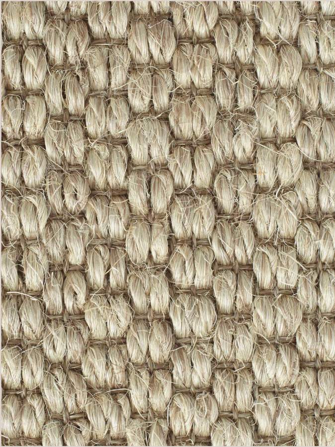
IMAGE ABOVE REPRESENTS A MAGNIFIED VIEW