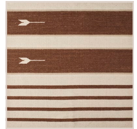
CHOCOLATE CHOCOLATE, IVORY, LINEN