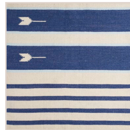
INDIGO INDIGO, IVORY, CHINA BLUE