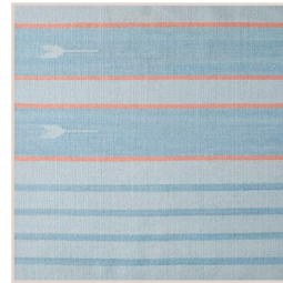
CHAMBRAY CHAMBRAY, CHINA BLUE, BLUSH