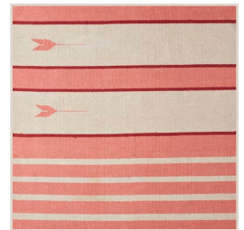
PINK PINK, IVORY, RED

Colors shown may differ slightly from actual product. Refer to a physical sample for true color representation. Talk to our project team about custom finishing options.