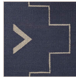
LAPIS SISAL LAPIS, SUEDE MARSHMALLOW