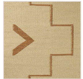
NATURAL SISAL NATURAL, SUEDE CARAMEL

Colors shown may differ slightly from actual product. Refer to a physical sample for true color representation. Talk to our project team about custom finishing options. Due to the nature of handmade rugs, please be advised that there might be slight variances in color and size. Standard allowable variance is 3.5% of the overall size of the rug.