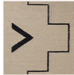
BLACK PEARL SISAL PEARL, SUEDE BLACK