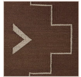
CHOCOLATE SISAL CHOCOLATE, SUEDE MARSHMALLOW