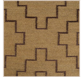
CAMEL SISAL CAMEL, SUEDE ESPRESSO