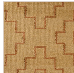
HONEY SISAL HONEY, SUEDE CHESTNUT