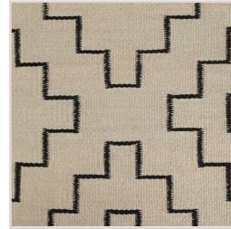
BLACK PEARL SISAL PEARL, SUEDE BLACK