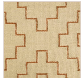
NATURAL SISAL NATURAL, SUEDE CAMEL

Colors shown may differ slightly from actual product. Refer to a physical sample for true color representation. Talk to our project team about custom finishing options. Due to the nature of handmade rugs, please be advised that there might be slight variances in color and size. Standard allowable variance is 3.5% of the overall size of the rug.