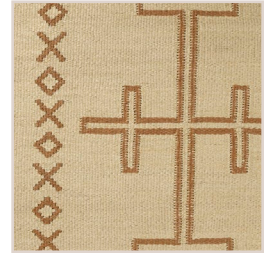
NATURAL SISAL NATURAL, SUEDE CARAMEL