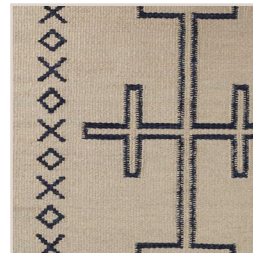
NAVY PEARL SISAL PEARL, SUEDE NAVY