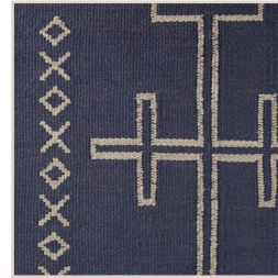
LAPIS SISAL LAPIS, SUEDE MARSHMALLOW