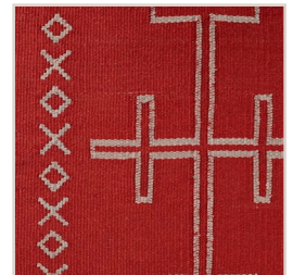
RED SISAL RED, SUEDE TAUPE

Colors shown may differ slightly from actual product. Refer to a physical sample for true color representation. Talk to our project team about custom finishing options. Due to the nature of handmade rugs, please be advised that there might be slight variances in color and size. Standard allowable variance is 3.5% of the overall size of the rug.