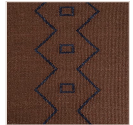
CHOCOLATE SISAL CHOCOLATE, SUEDE NAVY

Colors shown may differ slightly from actual product. Refer to a physical sample for true color representation. Talk to our project team about custom finishing options. Due to the nature of handmade rugs, please be advised that there might be slight variances in color and size. Standard allowable variance is 3.5% of the overall size of the rug.