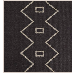
BLACK SISAL BLACK, SUEDE MARSHMALLOW