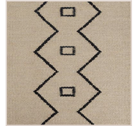
BLACK PEARL SISAL PEARL, SUEDE BLACK