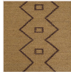
CAMEL SISAL CAMEL, SUEDE ESPRESSO