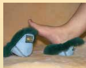
Medical Sheepskin Heel Dressing

SSBS (small) SSBL (large) SSBM (med) SSBXL (X-large)