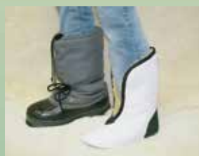
Boot Liners (pair)