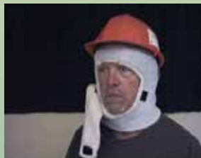
Fire Retardant Sheepskin Hood