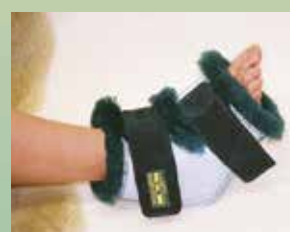
Heel Protectors (pair)

PCBMHS (small) PCBMHL (large) PCBMHM (med) PCBMHXL (X-large)