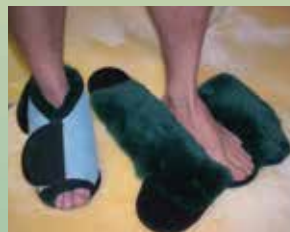
Pressure Care Slipper with Rubber Sole

EPSMHS (small) EPSMHL (large) EPSMHM (med) EPSMHXL (X-large)