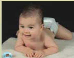
Domestic Rug Natural Shape (approximately 39" by 30")