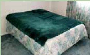
Bariatric Bed Pad Approximately 80" by 60"