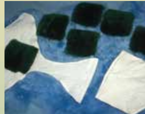
Reusable Coccyx Panties and Pads

RCP-2 (small - medium) RCP-3 (medium -large)