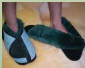
Wrap Around Slipper with Rubber Sole

RCP-2 (small - medium) RCP-3 (medium -large)