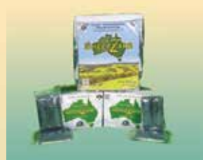
SheepZorb Disposable Dressings (4" x 4")

MSHD - 3 per pack Heel Dressings to be used in conjunction with Heel and Elbow Protectors.