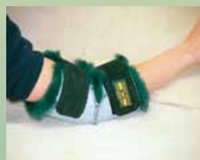
Elbow Protector (1 each)