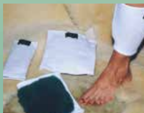
Limb Pressure Guard (4 sizes)