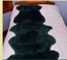
MSHEP Bed Pad Approx. 85" by 30"