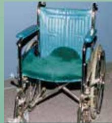
Wheel Chair Pad*

MC1 - Contour Shape 21" by 18" MC2 - Standard Shape 17" by 15"