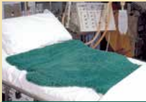
Chair and Bed Pad Approximately 39" by 30"

These bed pads are 100% natural Australian Merino Sheepskin, available in medical green only. Wash at high temperature (80°C) using SKINSAN Liquid Sheepskin Detergent, and tumble dry.