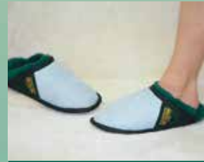
Medical Mules (4 sizes)

DSCR - Domestic Sheepskin Cuff with Rubber Sole DSR - Domestic Sheepskin with Rubber Sole