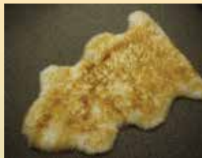
Domestic Long Hair Throw Rugs