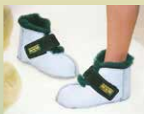
Regular Short Boot (easy access - 4 sizes)

LBMS (small) LBML (large) LBMM (med) LBMXL (x-large)