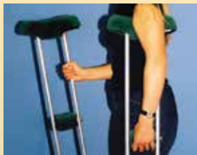
Crutch Covers* (pair)

The real breakthrough has been the development of High Temperature U.R. (Urine Resistant) Medical Sheepskins. When cared for with SKINSAN, they are safely washable at temperatures of 80°C with no deterioration, thermally and chemically disinfecting them, allowing for their safe use many times.