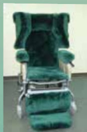
Broda Chair Accessories

UNICW18M - 16" by 18" (seat and back) ARI - Arm Rest (pair)-measurements required CPI - Calf Pad (pair) FRI - Foot Rest (pair)