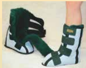
Long Split Boot Adjusts to suit the leg & foot

MC1 - Contour Shape 21" by 18" MC2 - Standard Shape 17" by 15"