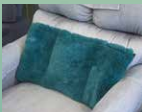
Adjustable Lumbar Support