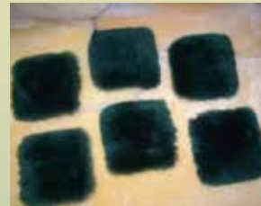
Coccyx Pads (5" by 5")

SBMS (small) SBML (large) SBMM (med) SBMXL (x-large)