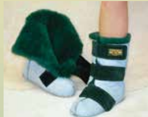
Regular Long Boot (easy access - 4 sizes)

LBMS (small) LBML (large) LBMM (med) LBMXL (x-large)