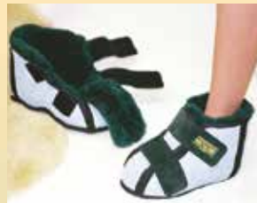
Short Split Boot For Hammer Toe & Diabetic ulcers

LSBS (small) LSBL (large) LSBM (med) LSBXL (X-large)