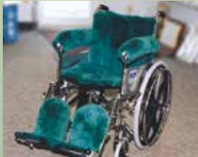
Wheel Chair Covers* for seat and back

UNICW18M - 16" by 18" (seat and back) ARI - Arm Rest (pair)-measurements required CPI - Calf Pad (pair) FRI - Foot Rest (pair)