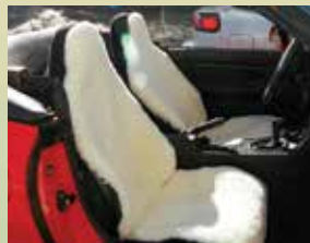
Car Seat Cover