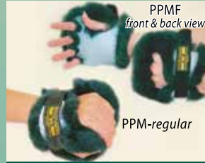
Palm Protectors (pair)

SSMS (small) SSML (large) SSMM (med) SSMXL (X-large)