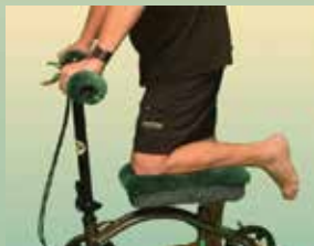
Knee Walker with elastic skirt 15" by 7"

WG1 – Walker Grips * Supply Measurements